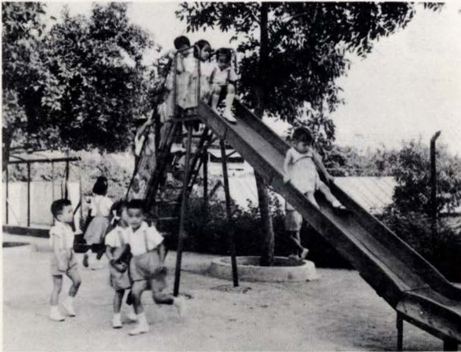
CHILDREN OF ST. PETER'S CHURCH KINDERGARTEN (CASTLE PEAK), HONG KONG